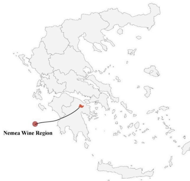
Figure 1. Greece and Nemea wine region

located in the Prefecture of Corinth in the north-eastern Peloponnese. The Peloponnese must surely have been one of the first places on earth to systematically grow grapes and make wine (at least for the past 4,000 years). Corinth is the major red wine supplier of Greece, with a total vineyard hectares of 6,137 in which about a third (2,123ha) is Nemea VQPRD ( Vins de Qualité Produits dans des Régions Déterminées ). 6 Nemea wine is the only PDO of the region and in fact, viticulture is the main agricultural activity in Nemea, where most local income comes from the wine economy. Considering its size as a wine region, Nemea is one of the major ones in the country, consisting of 17 rural communities and Nemea VQPRD is traditionally 100% Agiorgitiko grape variety. 7