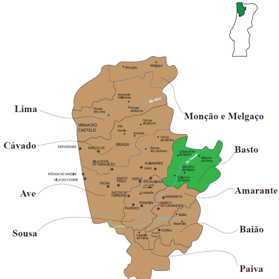
Figure 3. The nine Vinho Verde sub-regions and Basto sub-region