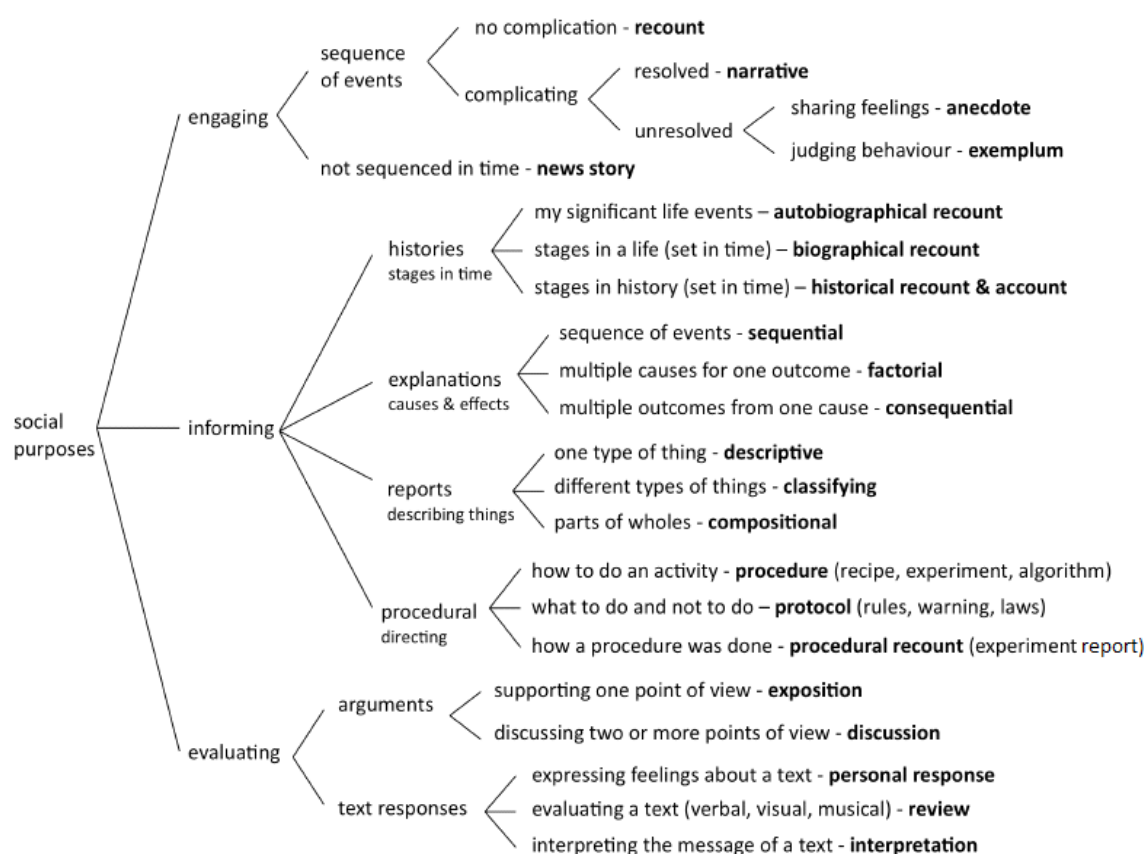
Figure 2. Genres developed in school

According to Martin and Rose (2007), genre is “a staged, goal-oriented social process” (p. 8). This definition highlights its staged nature, which implies that multiple steps need to be followed in order to achieve the specific purpose of the genre. Genres are also goal-oriented because they are driven by communicative intentions. And they are social because communication occurs with other people, not in isolation. SFL genre specialists have developed a genre classification system that categorizes social processes within educational contexts. Each genre involves a series of predictable stages. The stages of a genre help structure and organize the communication process, ensuring that each part contributes to achieving the overall communicative goal. Figure 2 shows the variety of genres found in educational settings.